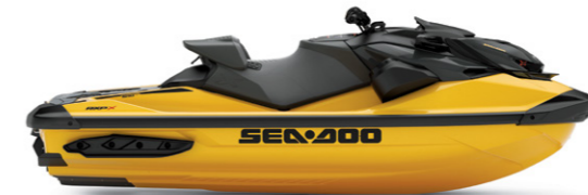
● Millennium Yellow